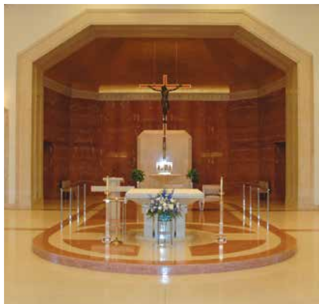
Chapel at Mt. Augustine

When the 140th anniversary of the Community was celebrated, construction began for Regina Health Center, a $7.5 million innovative health care and assisted living facility for religious, priests and laity who wished to live in a God-centered environment of care. The renovation of a portion of the existing Motherhouse building and others provided an 81-bed skilled and intermediate care nursing unit and a 73-bed assisted living unit that opened in 1983 with a full range of geriatric services for retired female and male religious. Additional nursing beds and other services